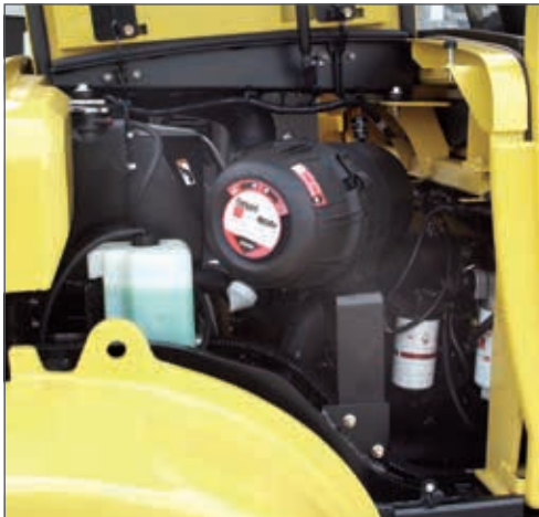
Easy service access