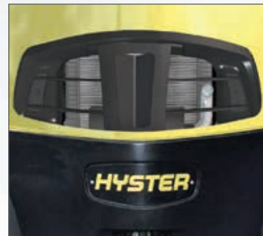
Counterweight tunnel design