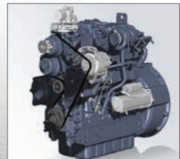
High output Kubota 3.8L turbo diesel engine