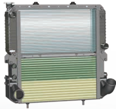
Diesel radiator features air to air intercooler technology