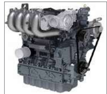
Kubota 3.8L LPG engine